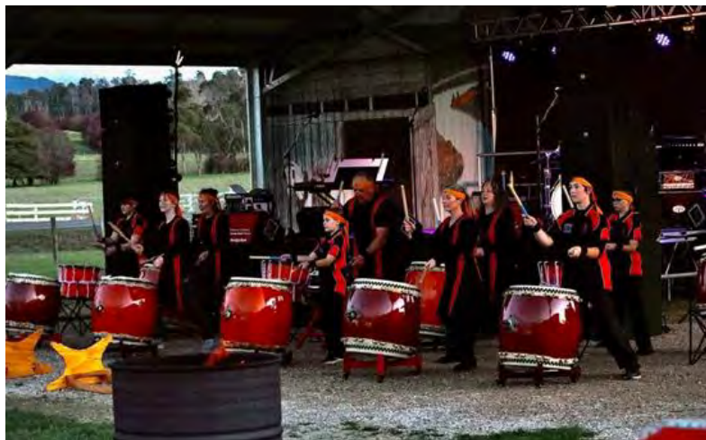
Taiko Oni Jima at Deloraine (Winterfire – 2023)

In June, Taiko Oni Jima was a feature act once again at the 'Winterfire' event that again was held in June, again at Deloraine. Whilst the Tuesday beginner's classes were again well populated, consistency at the Friday performers classes was once again dictated by our performance calendar.