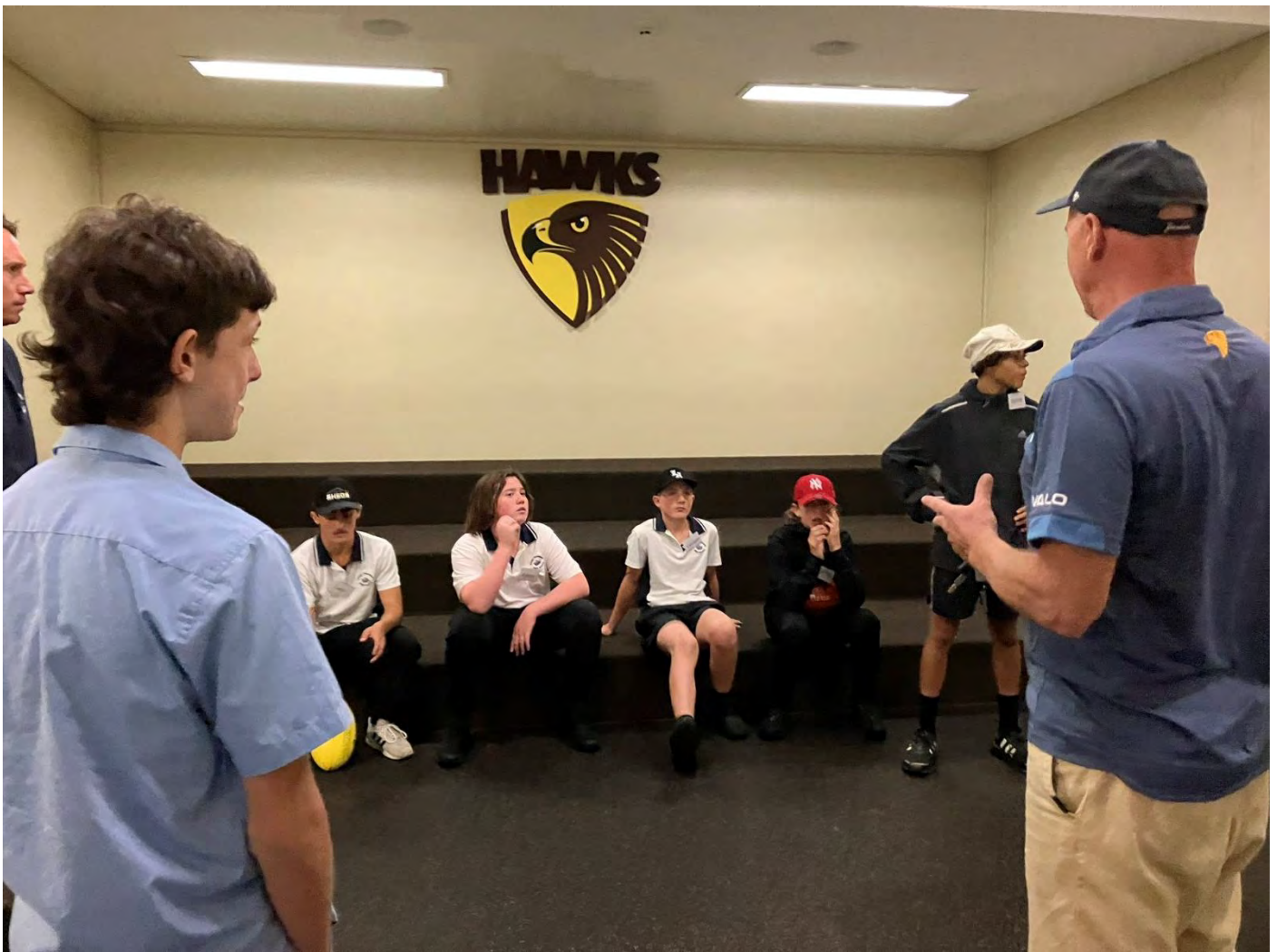
RESET group at Hawthorn Football Club