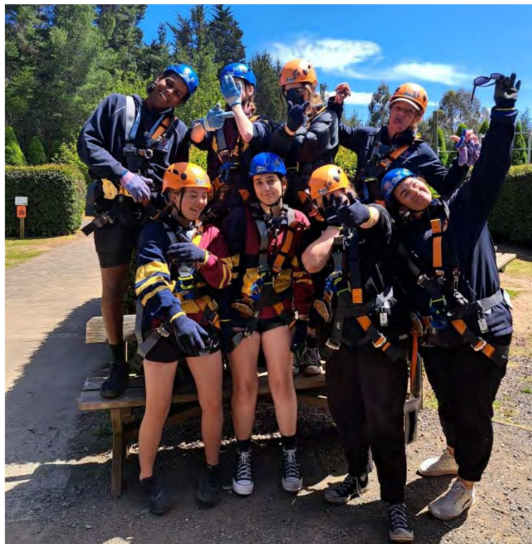
ASCENT group at Hollybank

Special thanks to the Cheesecake Shop, Merridew Foundation, Coles Newstead, Woolworths Launceston and the Australian Maritime College for their ongoing support, to the schools for working so productively with us, to Police and Education for facilitating the partnership and to the staff for never ending smiles.