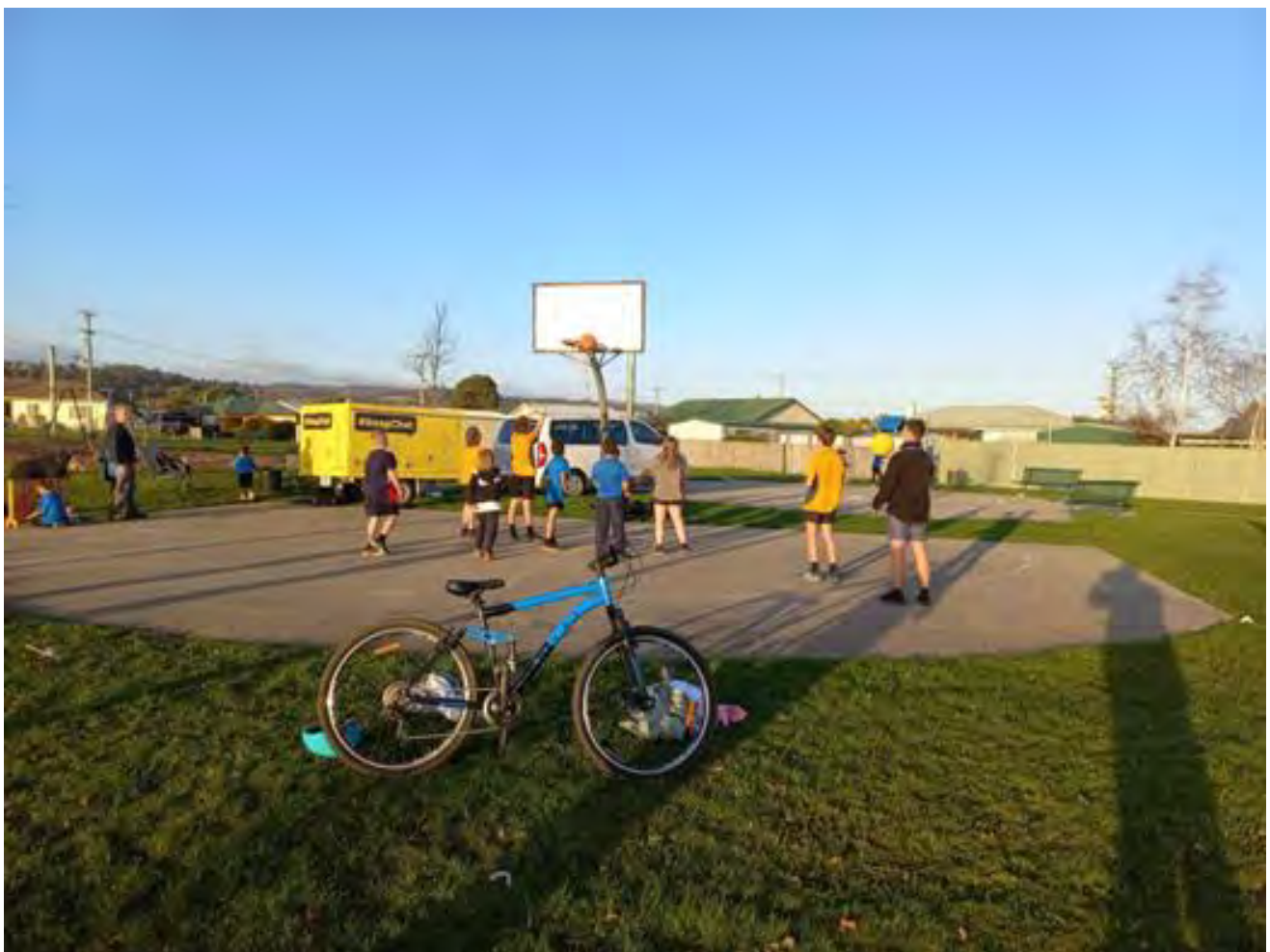
MAC activities at Torrens Street Park, Mayfield

After a very quiet January, school resumed for term 1 and things gradually improved, again with some remote location and community-based sessions being held. The MAC program also reacquainted itself with the RESET (school based) program, with a combination of the recreation activities and Taiko Drumming sessions held at the PCYC, and at UTAS Stadium. The ability to run remote location activity sessions was also made possible by generous and ongoing funding by the Northern Midlands Council. A feature of the MAC program has been its ability to operate at some of the high need's areas in and around Launceston in partnership with the Northern Suburbs Community Centre and City Mission.